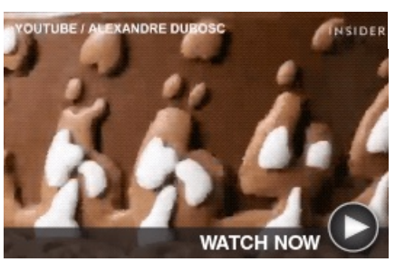
Unbelievable Spinning Cake Made by a French artist, this popcorn-themed cake puts a new spin on things by creating the illusion of moving objects.