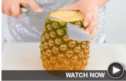
Strawberry Pineapple Salsa Get ready for summer fun and celebrate National Salsa Month with this easy-to-make fruit salsa.