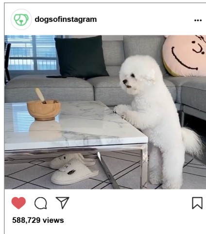
Persistent Pup Despite an impressive and valiant effort, this fluffy friend can't quite reach the nibbles she craves.