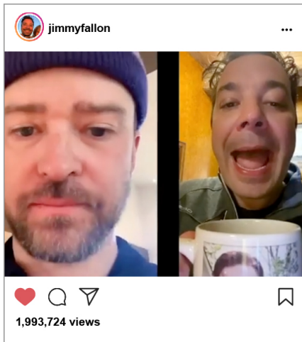
Fallon and Timberlake Jimmy Fallon and Justin Timberlake make the most of their at-home time by creating an at-home song.