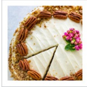
Moist and Flavorful Fruity Layer Cake

You haven't started pinning on Pinterest yet and you want to get started? If so, click here .