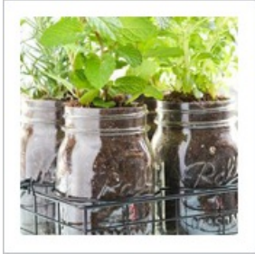
Easy & Inexpensive Jar Herb Garden