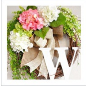
Pretty Handmade Spring Wreath Ideas