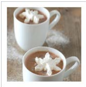
Creamy Hot Cocoa With Cute Snowflakes