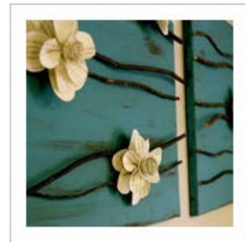
Beautiful On A Budget With DIY Wall Décor

You haven't started pinning on Pinterest yet and you want to get started? If so, click here .