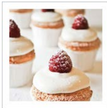
Snow Angel Cupcakes Are A Holiday Treat