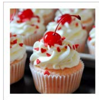
Tasty Heart-Speckled V-Day Cupcake Treats

You haven't started pinning on Pinterest yet and you want to get started? If so, click here .