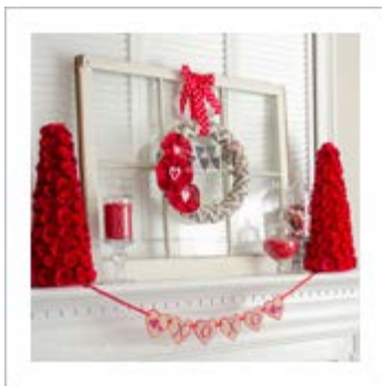
Beautiful Valentine Tree For Your Mantel