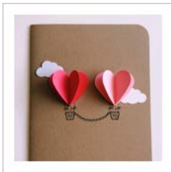
Make Your Own Cute Valentine's Day Card