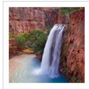
Fun Things To Do In Every U.S. State

You haven't started pinning on Pinterest yet and you want to get started? If so, click here .