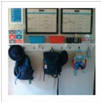
Create A Family Organization Station