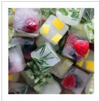
Cool Ice Cubes With Fruit And Herbs