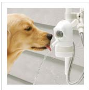
Make A Splash With Dog-Activated Fountain