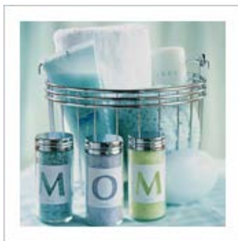
Help Mom Relax With Bath Salts Just For Her