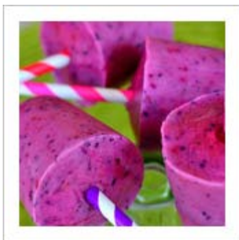
Berry Delicious Greek Yogurt Smoothie Pops