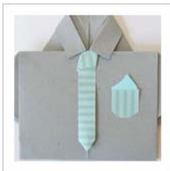
Make A "Shirt & Tie" Card Tailored For Dad