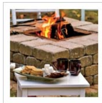
30 DIY Ideas For An Awesome Backyard

You haven't started pinning on Pinterest yet and you want to get started? If so, click here .