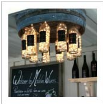
Light Up Where You Dine With Wine