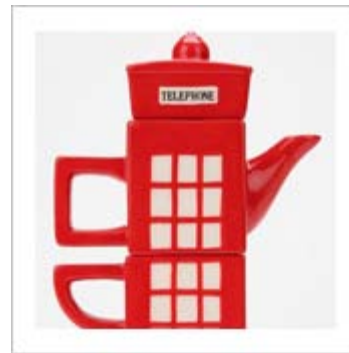
A Little Bit of London For Afternoon Tea

You haven't started pinning on Pinterest yet and you want to get started? If so, click here .