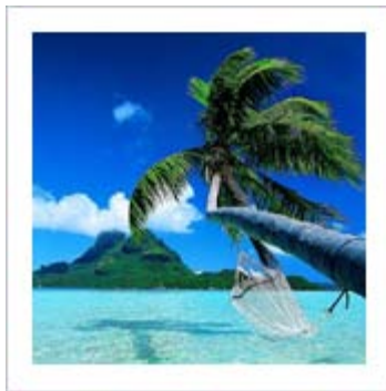
A Dreamy Photo Of A Beach Paradise