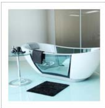
Wow! Smart Bathtub Cleans Itself And More