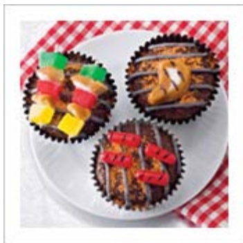
Sizzling Cupcake Ideas For BBQ Parties