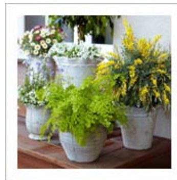
Plants To Keep Bugs From Bugging You

You haven't started pinning on Pinterest yet and you want to get started? If so, click here .