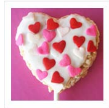
Heartwarming Sweet Treats On A Stick

You haven't started pinning on Pinterest yet and you want to get started? If so, click here .