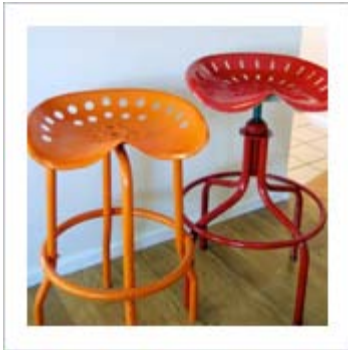
Turn Tractor Seats Into Hardworking Stools