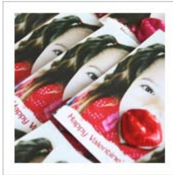
Candy Lips Create A Picture-Perfect Valentine