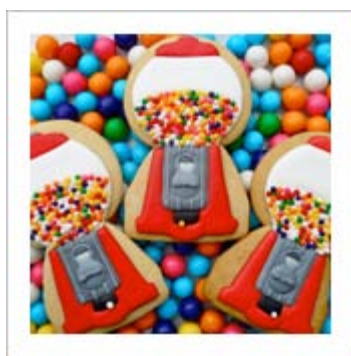
Deliciously Detailed Gumball Machines