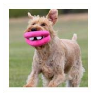
A Dog Toy To Make Everybody Smile

You haven't started pinning on Pinterest yet and you want to get started? If so, click here .