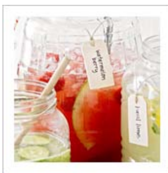
When Life Hands You A Watermelon...