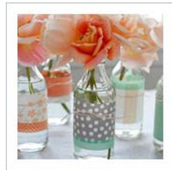
Wrap Up Cute, Quick, And Colorful Vases

You haven't started pinning on Pinterest yet and you want to get started? If so, click here .