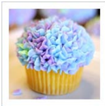
Sweet Cupcake Is Spring In Full Bloom