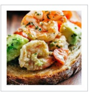
Shrimp And Avocado Garlic Bread