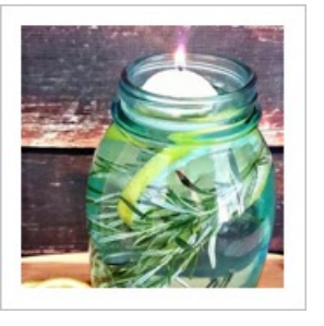
Repel Bugs With Mason Jar Luminaries