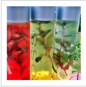
Cool & Refreshing Infused H2O Recipe