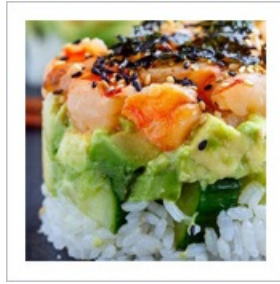
Make Your Own Spicy Shrimp Sushi