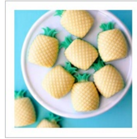
Adorable Pineapple Piña Colada Soaps

You haven't started pinning on Pinterest yet and you want to get started? If so, click here .