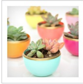
Adorable Succulent Planters For Spring