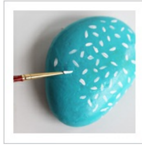
Make These Colorful Rock Photo Holders