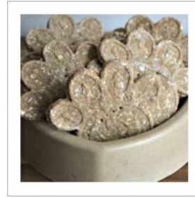
Your Dog Will Love These DIY Treats

You haven't started pinning on Pinterest yet and you want to get started? If so, click here .