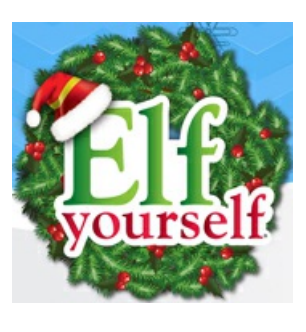
ElfYourself Download this holiday app to turn yourself and friends into elves, then share the fun dancing elf videos on social media.

FREE Featured Apps – These Three Are Well Worth A Look