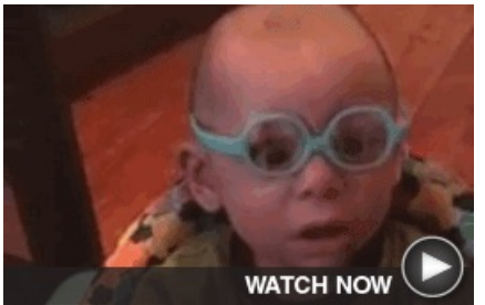
Baby's First Glasses For this giggly baby, the gift of better sight isn't just necessary, it's a whole lot of fun.

Two To View – A Couple Of Amazing Videos You Don't Want To Miss