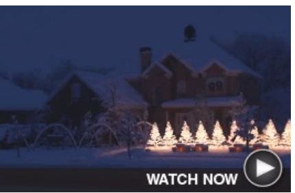
Beyond Awesome Holiday Lights Your holiday lights might be impressive, but are they set to music? Watch and be wowed.