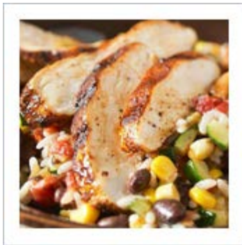
Spicy Chicken With Rice And Beans