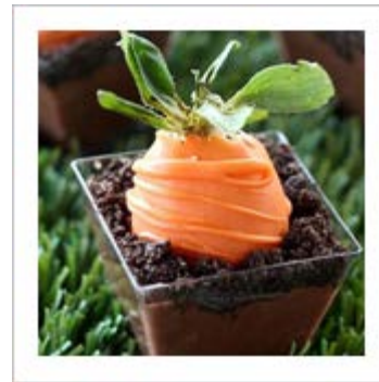
Carrot Dessert Cups: So Cute For Easter

You haven't started pinning on Pinterest yet and you want to get started? If so, click here .