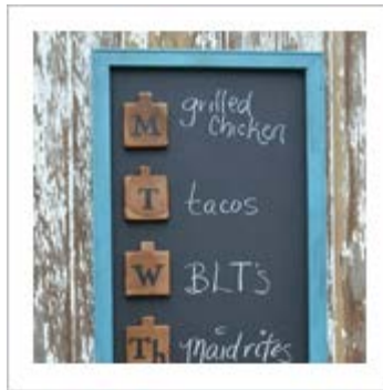
Meal Planning Board For Your Kitchen