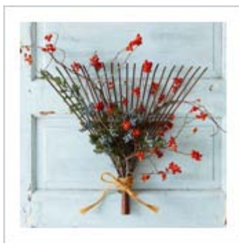
Old Rake Makes Festive Door Décor