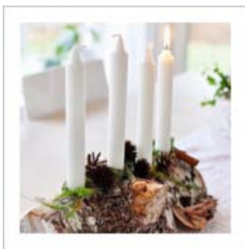
Pretty Pinecone and Candle Centerpiece