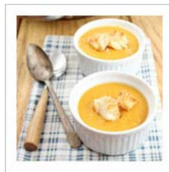
Hearty and Healthy Fall Squash Soup

You haven't started pinning on Pinterest yet and you want to get started? If so, click here .