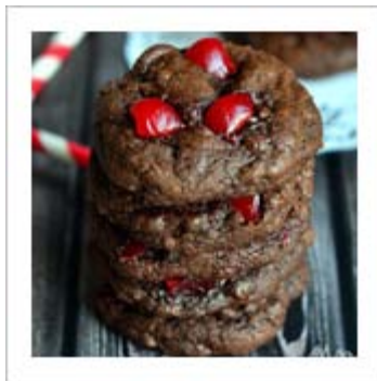
Chomp On Chewy Chocolate Cherry