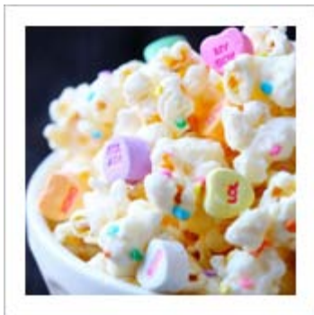
Colorful And Delicious Valentine's Day Treat