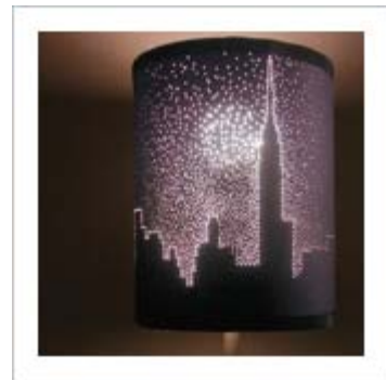
Ordinary Lampshade Becomes Night Sky

You haven't started pinning on Pinterest yet and you want to get started? If so, click here .