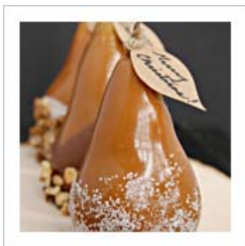
Delicious & Festive Caramel Dipped Pears