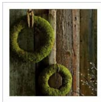
Moss Makes Pretty Seasonal Décor

You haven't started pinning on Pinterest yet and you want to get started? If so, click here .