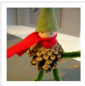
Create An Adorable Pine Cone Elf