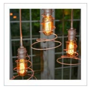
Recycled Bedsprings Make Stylish Lamps

You haven't started pinning on Pinterest yet and you want to get started? If so, <u>click here</u>.