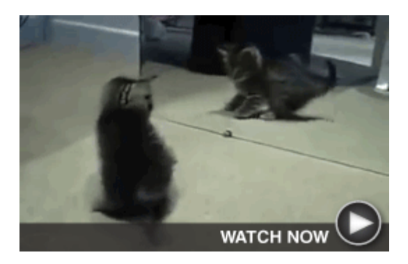
Kitten Goes Crazy For Reflection Who knew the mirror could be a place to find a playmate? Watch what happens when this adorable kitten tries to attack its new "friend."