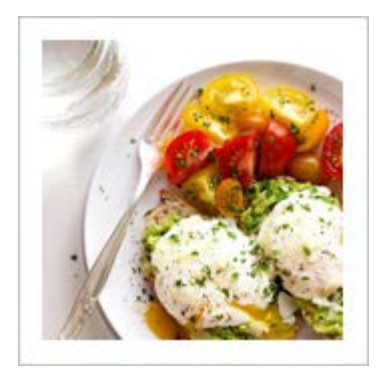
Simple And Healthy Poached Egg Idea