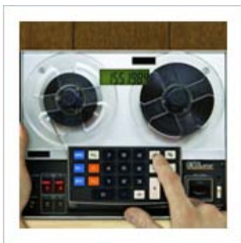
Retro Calculator Adds Up To Cool Memories