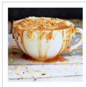
Coconut Hot Chocolate & Whipped Coconut Cream

You haven't started pinning on Pinterest yet and you want to get started? If so, click here .