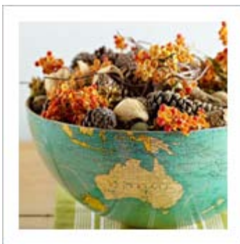
You'll Fall For These Festive Fall Centerpieces