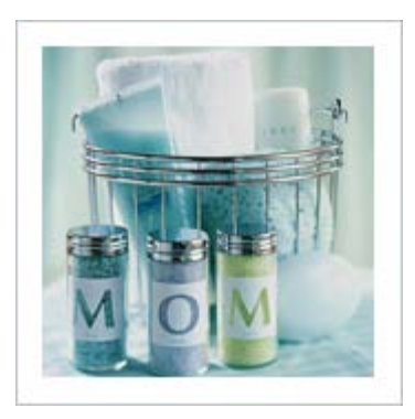
Help Mom Relax With Bath Salts Just For Her