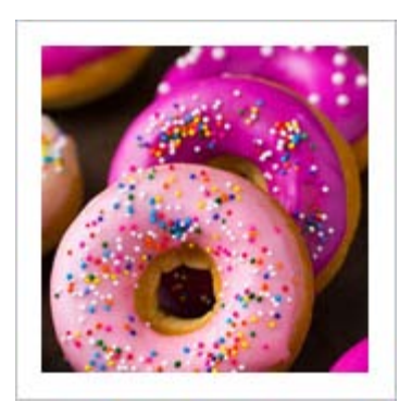
Brighten Breakfast With Vanilla Bean Doughnuts

You haven't started pinning on Pinterest yet and you want to get started? If so, click here.