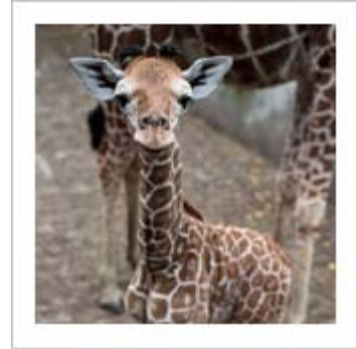
This Baby Giraffe Is Too Cute For Words

You haven't started pinning on Pinterest yet and you want to get started? If so, click here .