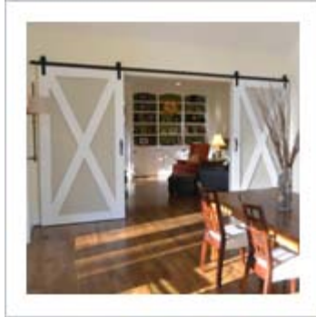
Sliding Barn Door Adds Cool Country Touch