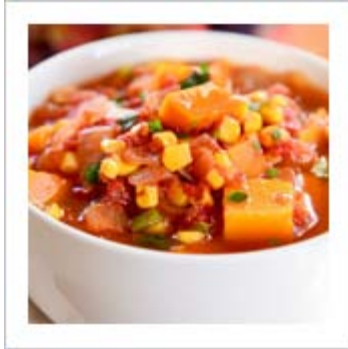
Try Yummy Tomato Butternut Squash Soup