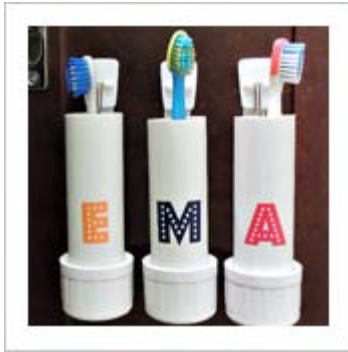
Clever Bathroom Storage From Pipe