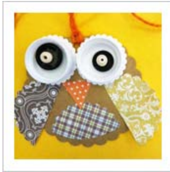
Whoop, Whoop Wants An Owl Craft Idea?