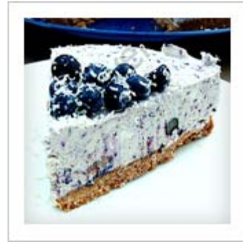
Blueberry And White Chocolate Cheesecake

You haven't started pinning on Pinterest yet and you want to get started? If so, click here .