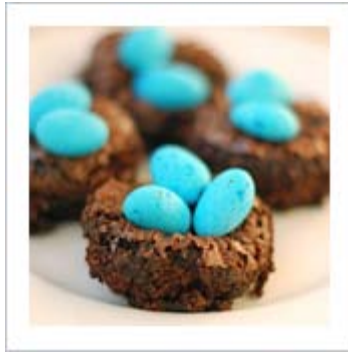
A Sweet Easter Treat: Eggs In Brownie Nests