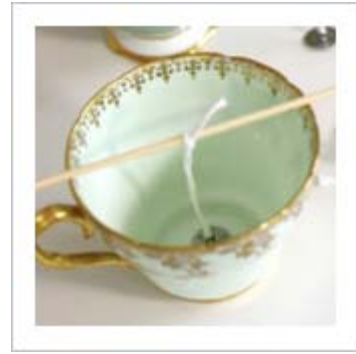
This Craft Project May Be Your Cup Of Tea

You haven't started pinning on Pinterest yet and you want to get started? If so, click here .