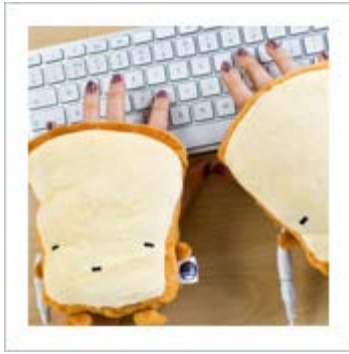
"Toasty" Handwarmers Are A Slice Of Heaven