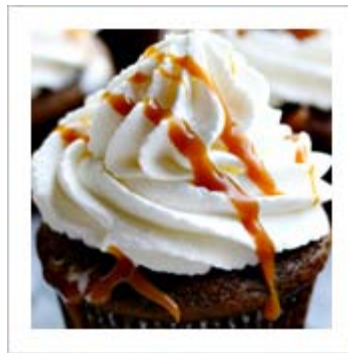
Try Pumpkin Spice Latte Cupcakes

You haven't started pinning on Pinterest yet and you want to get started? If so, click here .