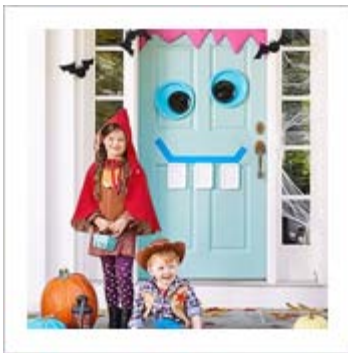
Adorable Halloween Door Decorations