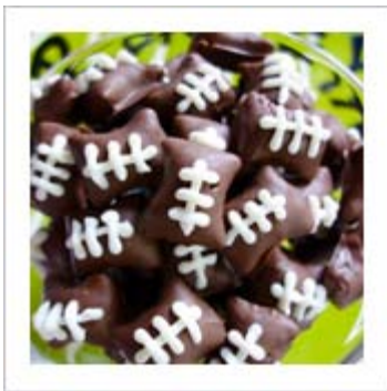
Football Pretzel Bites Are Game Day Winners