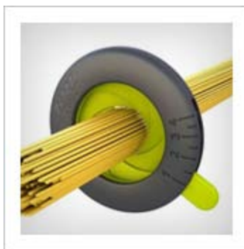
Measure The Perfect Amount Of Pasta