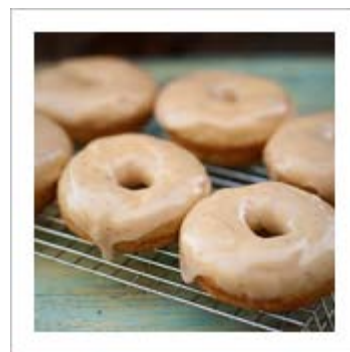
Out Of The Oven And Into Your Mouth