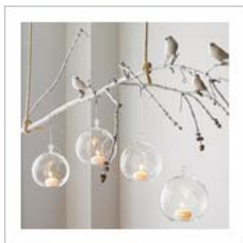
Branch Out In Your Winter Decor