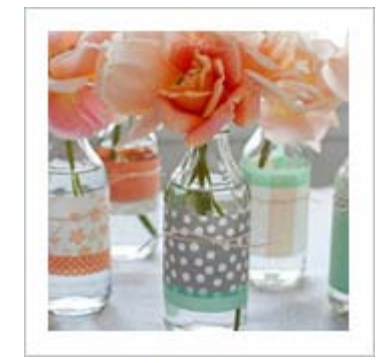
Wrap Up Cute, Quick, And Colorful Vases

You haven't started pinning on Pinterest yet and you want to get started? If so, click here.