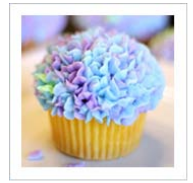
Sweet Cupcake Is Spring In Full Bloom