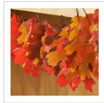
Autumn Leaves Garland

You haven't started pinning on Pinterest yet and you want to get started? If so, click here .