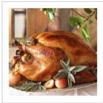
Martha Stewart's Perfect Roast Turkey