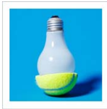
Tennis Ball as Light Bulb Remover