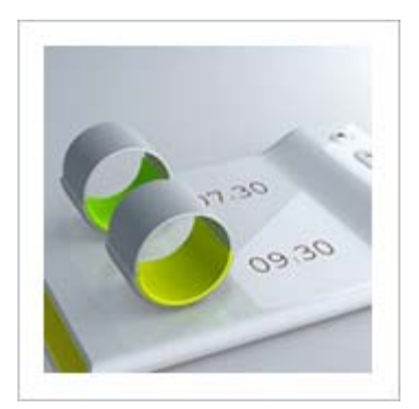
Wear A Ring To Be Awakened

You haven't started pinning on Pinterest yet and you want to get started? If so, click here.